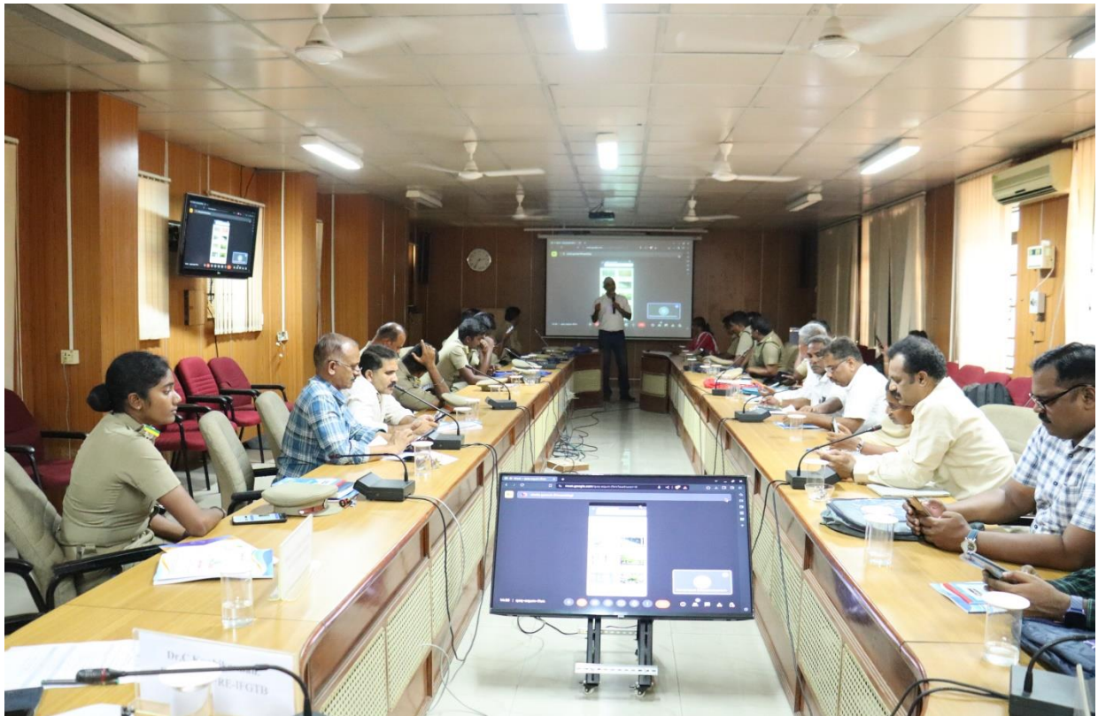
Participants downloading the Mobile app and demonstrating the features