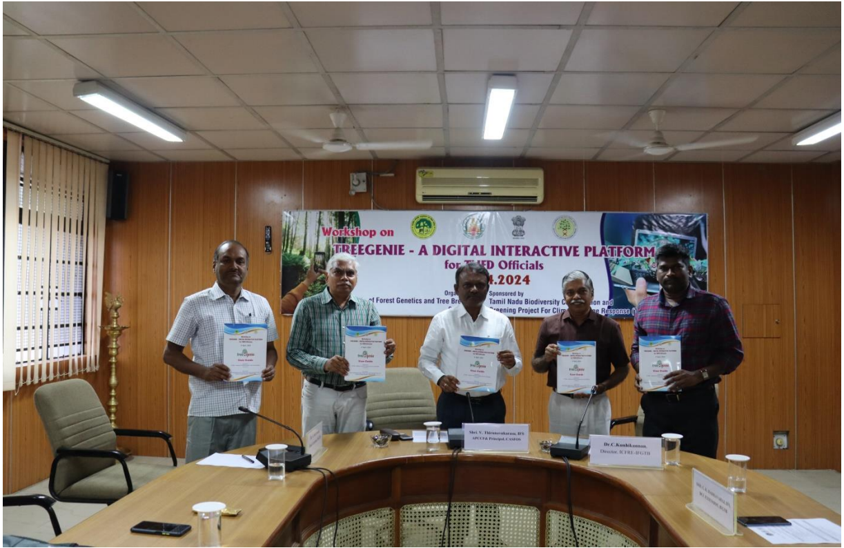
Release of TreeGenie User Manual